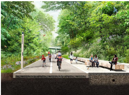
Rendering by MNLA courtesy of OSI