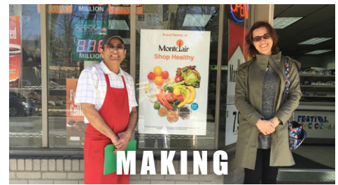
MAKING healthy choices easier

the lives of our most vulnerable neighbors by meeting immediate health needs and by advocating for sustainable changes to policies and systems. Together with our community partners, we're making our communities healthier, better places.