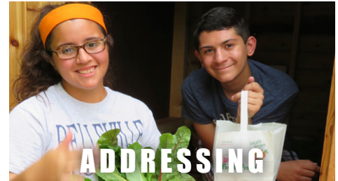
ADDRESSING hunger and homelessness