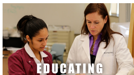
EDUCATING Nurses through scholarships

Since 2008, Partners for Health Foundation has made 324 grants to 110 organizations, totaling more than $10 million!