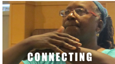
CONNECTING older residents to services and activities