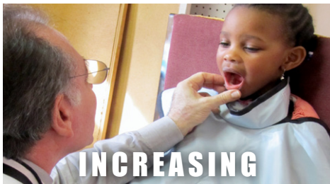
INCREASING access to oral health