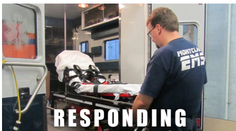
RESPONDING to emerging needs