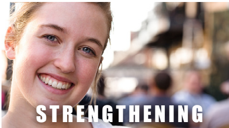
STRENGTHENING the mental health safety net